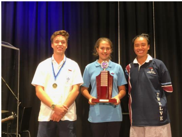
House Swimming Trophy for 2018 - HALL HOUSE